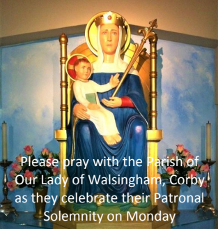
Please pray with the Parish of Our Lady of Walsingham, Corby, as they celebrate their Patronal Solemnity on Monday